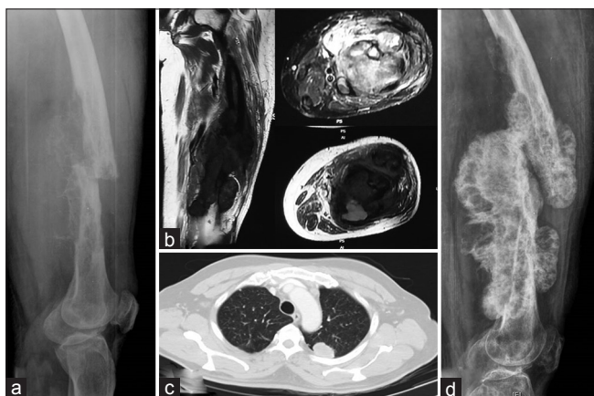
Figure 1: (a) Radiograph showing aggressive lytic lesion in diaphysis of the femur with pathological fracture (b) magnetic resonance image showing lesion involving entire length of the femur with soft-tissue component (c) computed tomographic image showing primary lung carcinoma (d) radiograph showing healed pathological fracture with good calcification of lesion, indicating good treatment response

With increase in survival of advanced carcinoma patients, there is a steep increase in the incidence and prevalence of skeletal-related events secondary to these aggressive tumors, which have preponderance for skeletal system apart from lung and liver. [1] Approximately 50% of advanced thyroid and lung carcinoma have skeletal metastasis. [2] Most of the skeletal lesions from these cancers cause swift destruction of bone leading which appear as lytic lesions on radiograph and are prone for pathological fractures.