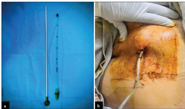
Figure 2: (a) Shows the Trocar catheter with pointed tip encircled and (b) shows the patient having a 24 G trocar catheter in situ .