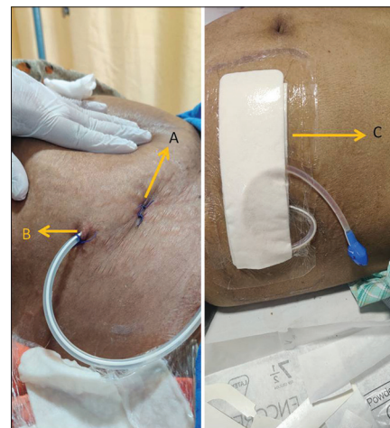
Figure 2: Tunnelled catheter in place with entry and exit sites and after applying protective dressing. A: Catheter entry point, B: Catheter exit point, C: Protective dressing.

We selected five patients for catheter insertion [Table 1]. Except in one patient, we had favourable outcomes in other four patients. The patient in whom we did not have good outcome had a coexisting pleural effusion which was not symptomatic till the day of procedure. He had relief in abdominal distension, pain and breathlessness immediately after procedure, but it was short lived. He was shifted to ICU day after the procedure with exacerbation of breathlessness and not able to maintain saturation with oxygen and facemask. On imaging, he had pleural effusion with acute respiratory distress syndrome. The family opted for supportive care and the patient died in intensive care unit subsequently.