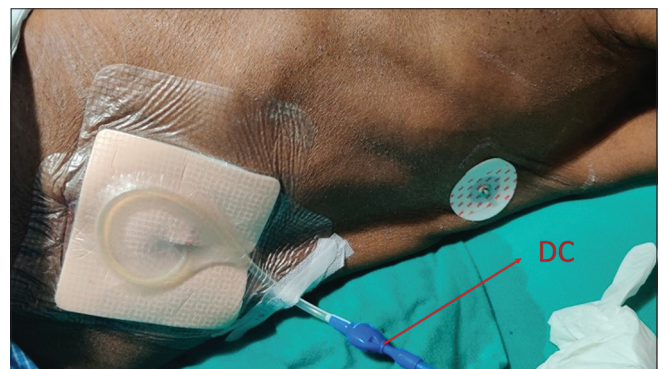
Figure 3: Drainage catheter is attached to tunnelled catheter and ascitic fluid being drained. DC: Drainage catheter.