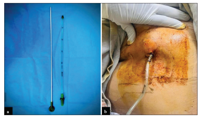
Figure 2: (a) Shows the Trocar catheter with pointed tip encircled and (b) shows the patient having a 24 G trocar catheter in situ.