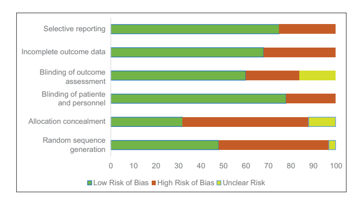
Figure 2: Risk of bias summary

Patients in 19 included studies were in stages 0–III of breast cancer diagnose and treatment. Four articles assessed breast cancer survivors.<sup>[27,33,34,39]</sup> Receiving concurrent classical