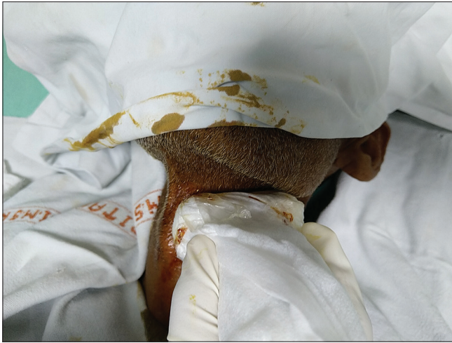
Figure 1: Position of ultrasound probe

the probe was then rotated cephalad to keep in line with the mandibular angle [Figure 1]. In this position, the pharyngeal wall was identified [Figure 2]. In-plane approach was used, and 2 ml of 2% lignocaine for the diagnostic blockade was given just above the pharyngeal wall using 5 cm 21-G insulated needle (Stimuplex® A - B. Braun Melsungen AG, Germany). The patient reported a pain score of 1/10 on NRS after 30 min of the blockade.