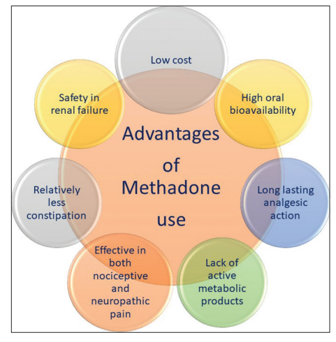
Figure 1: Advantages of methadone use in cancer pain management

The main finding of our study is that, dealing with all barriers under normal clinical conditions, and taking into consideration, a new opioid with different pharmacodynamics and pharmacokinetics, rotation to oral methadone in a palliative care unit appears to be safe and efficacious during at-least